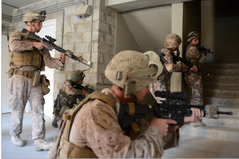
Members of the Jordanian Armed Forces and U.S. Marines participate in urban terrain training during exercise Eager Lion 16 at the King Abdullah II Special Operations Training Center, Kingdom of Jordan, a SOF center of excellence. The exercise is designed to strengthen relationships and interoperability between partner nations.