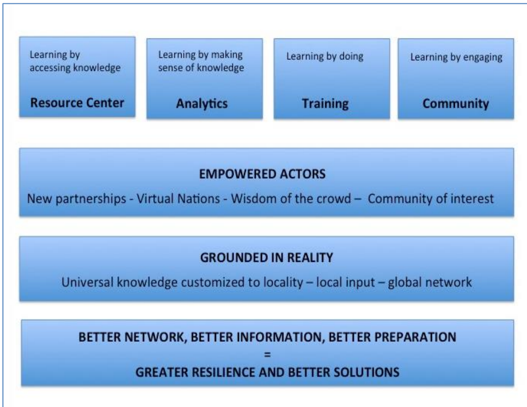
Figure 1: Four key features are necessary for the GSOC to build new global SOF enterprise partnerships with networked resilience.

The aggregation of these four elements comprises a tool kit that each TSOC should tailor to provide the global SOF enterprise, as part of a fusion center supporting composable organizations empowered by strategic reflection, as illustrated in the following graphic.