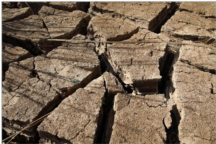
Drought and water shortages accompanying climate change can combine with other conflict accelerators to create multi-level and multi-dimensional threats.

In a world of panarchy, where threats may be both multi-level and multi-dimensional, the combination of a number of conflict accelerators may occur, such as drought and water shortages accompanying climate change, self-generated radical extremism fostered through the Internet, challenges to a nation’s core identity through narrative attacks posed through public media by a hostile nation, and so forth. When facing a terrorist, criminal, or hybrid warfare opponent, the first issue to examine is: “What are the driving factors and sources of conflict or paradigm of the enemy?” The second is: “What is the command-and-control structure of the enemy?” Force must be employed within a comprehensive approach in which collaborative sensemaking drives a good network to overcome a bad network. The