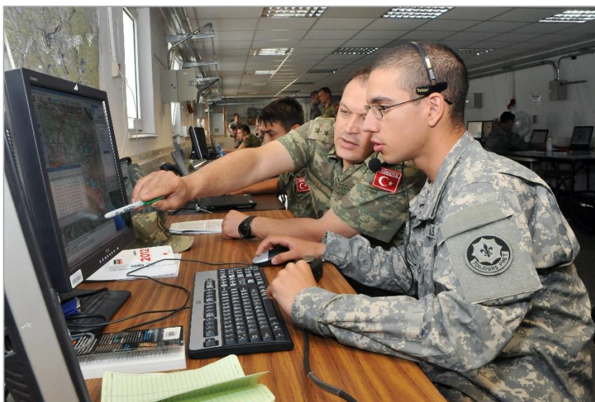
A U.S. soldier and a Turkish Land Force soldier participate in Cooperative Resolve 2012 at the Joint Multinational Simulation Center in Grafenwoehr, Germany. Cooperative Resolve is a battalion-level command post exercise focused on simulated joint military operations with the goal of enhancing interoperability by giving commanders and their staff practical exercises in organizing, controlling and supporting NATO operations.

Through an efficient blend of virtual gaming and constructive training, the VJC should eventually be capable of linking unclassified training and simulation centers across the global SOF enterprise and to its partners and allies to provide simulated exercise rehearsals without expending a bullet or a drop of fuel. It could provide simultaneous constructive simulations that supplement live training and expand the battle space for USSOCOM and multinational training units. It would train in the art and science of SOF from company-level to a three-star command and staff. Key capabilities would include a mission command program, digital mission command system training, support to small unit collective training, and the development and execution of command post exercises. It would foster wider